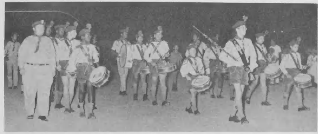
Inauguration of ASU Sports Week includes local Scout Drum Band . . .